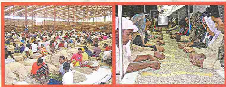
Carefully select green coffee of highest quality