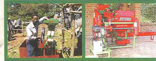
Pulp on the day of harvest using manual or power-driven pulpers