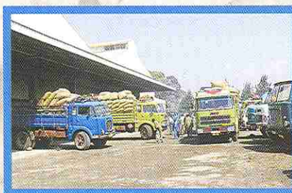
Transport coffee to port in properly covered lorries