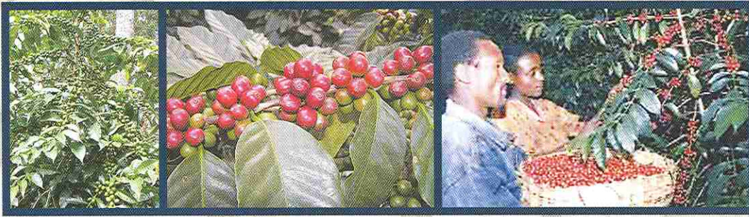
Harvest mature red cherries only

through enhanced processing practices to reap maximum returns