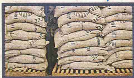
Store fully dry coffee in sisal/jute bags kept on wooden batten in clean, shaded and well ventilated area