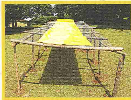
Drying coffee over Hessian cloth then yellow plastic sheet before rain and in the night