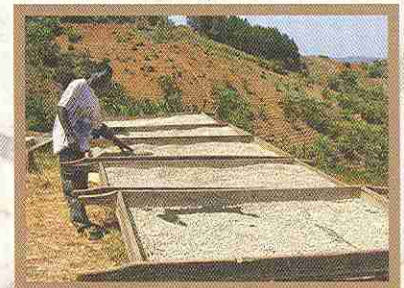
Undertake skin drying on hand trays: spread thinly, stir and remove defective beans, pulps and unpulped cherries